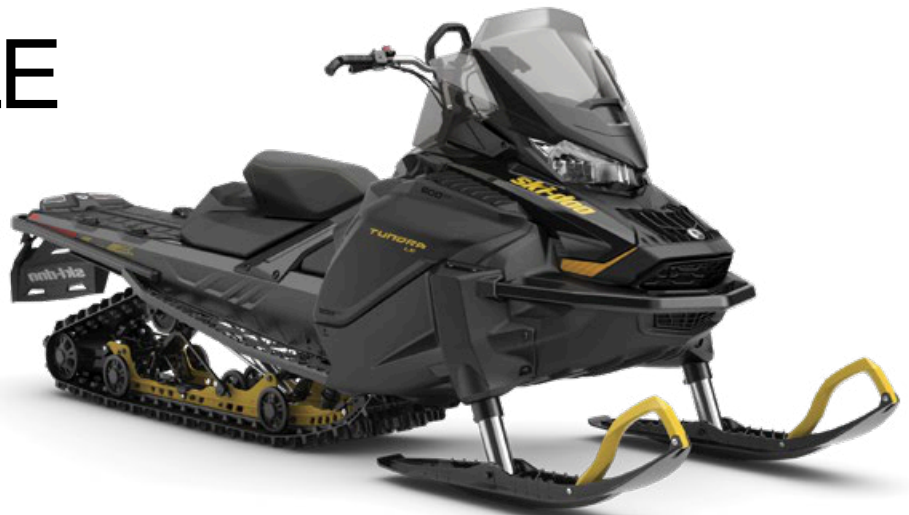
TUNDRA LE 600 EFI SHOWN

Great off-trail and deep snow performance with light-utility capability.